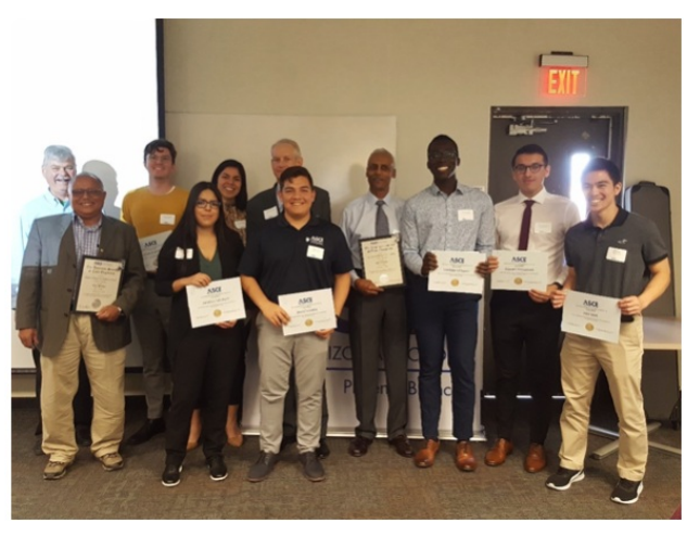
2020 Life Members and ASU civil engineering students