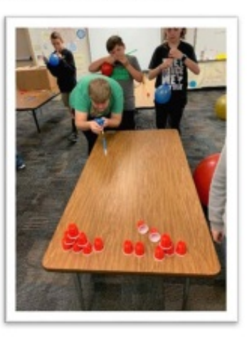
Thank you to everyone who volunteered!