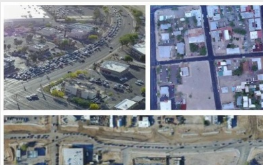
Drone Applications for Traffic Engineering