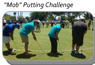
"Mob" Putting Challenge

Four-Person Scramble (Single Players Welcome)